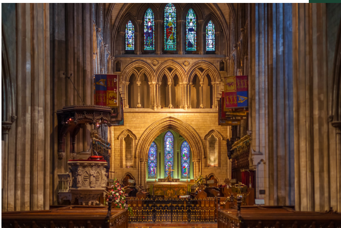
ST. PATRICK'S CATHEDRAL